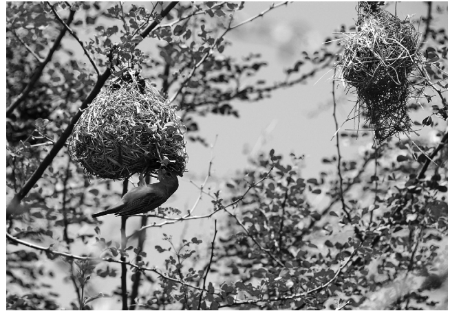
Figure 1: A Rüppell's Weaver Ploceus galbula female tending to her young, with an unfinished Lesser Masked Weaver ( Ploceus intermedius ) nest nearby. These two species regularly nest in association with each other at the study site in Awash National Park, Ethiopia

Thus the Rüppell's Weaver is not adequately described as a solitary nor a colonial nester. Two further terms might be employed to fill the continuum between these two extreme nesting situations in weavers, perhaps as well as